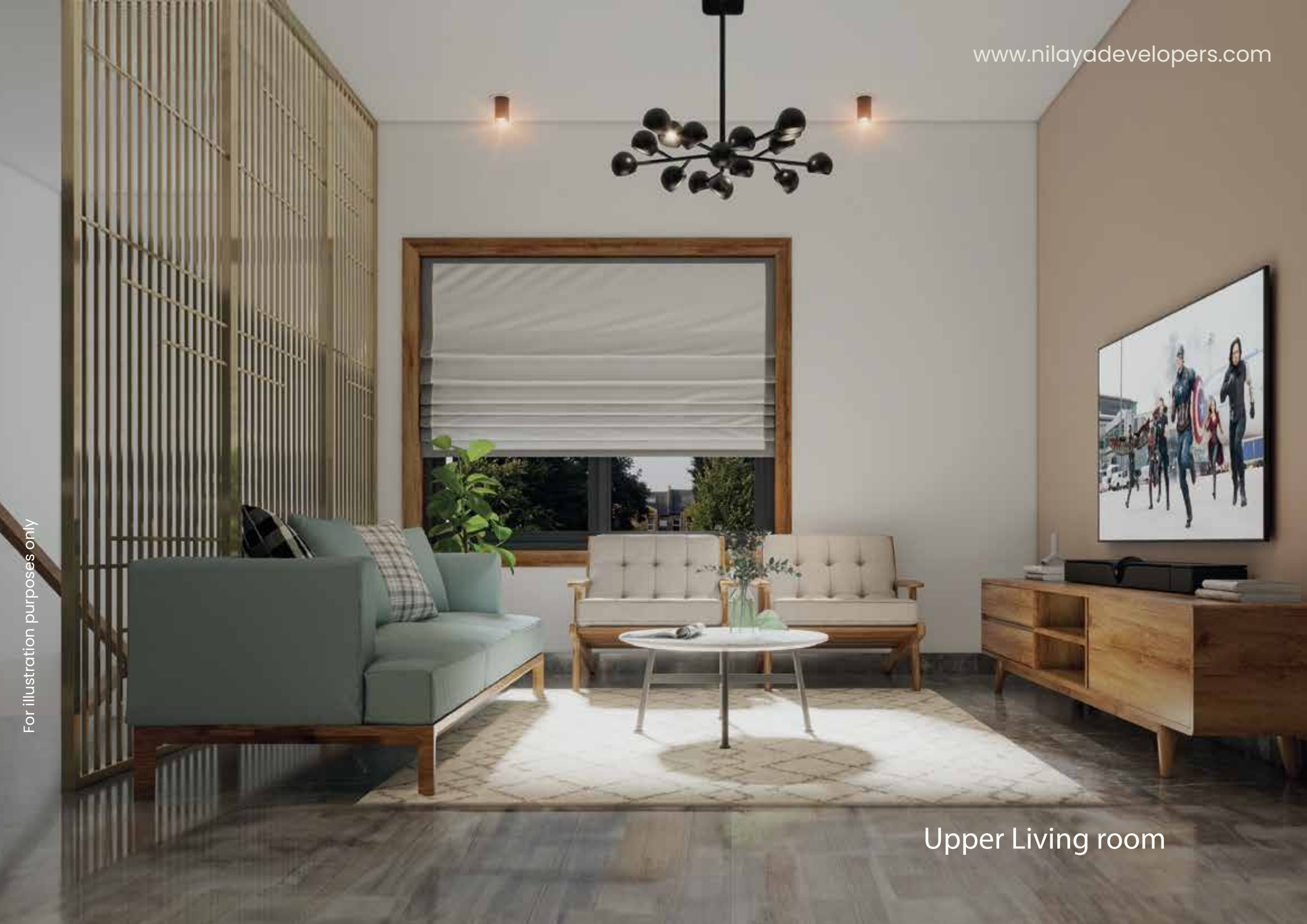
Upper Living room